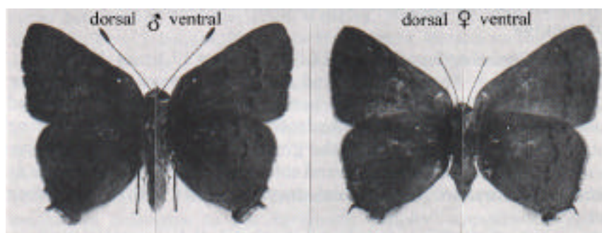
Figure 2. Satyrium auretorum fumosum , male (holotype), Malibu Lake, Los Angeles Co., CA 6 June 1948; female (allotype), same locality 16 June 1948.